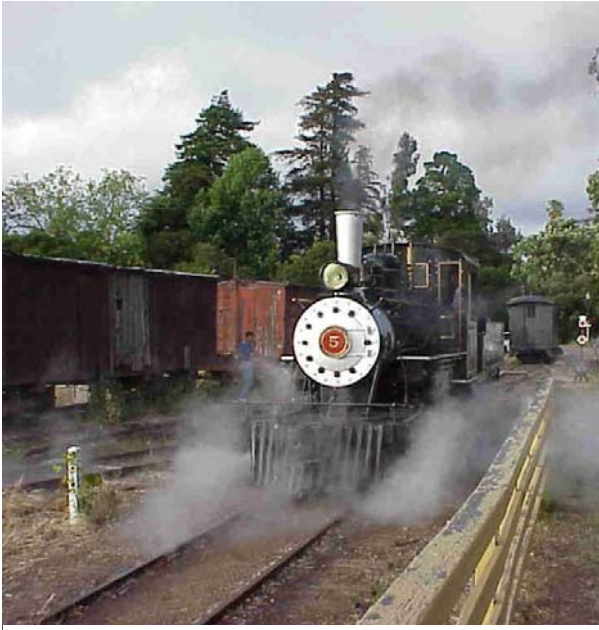
Steam Engine Hawaii #5 visited the SPCRR on Memorial Day Weekend 2000.