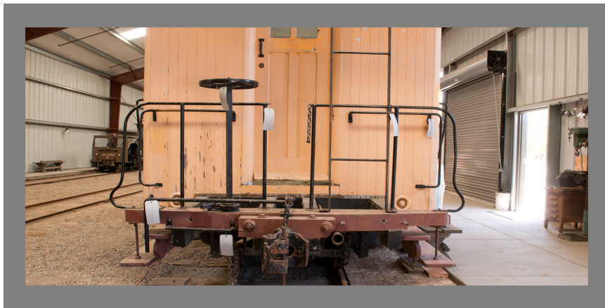
Caboose 6101, with hardware tagged for new part fabrication

Work days at the Car Barn have slowed down, to accomodate the outside work, but we'll keep you posted as these strands come together, and we're able to re-focus effort on caboose 6101 itself.