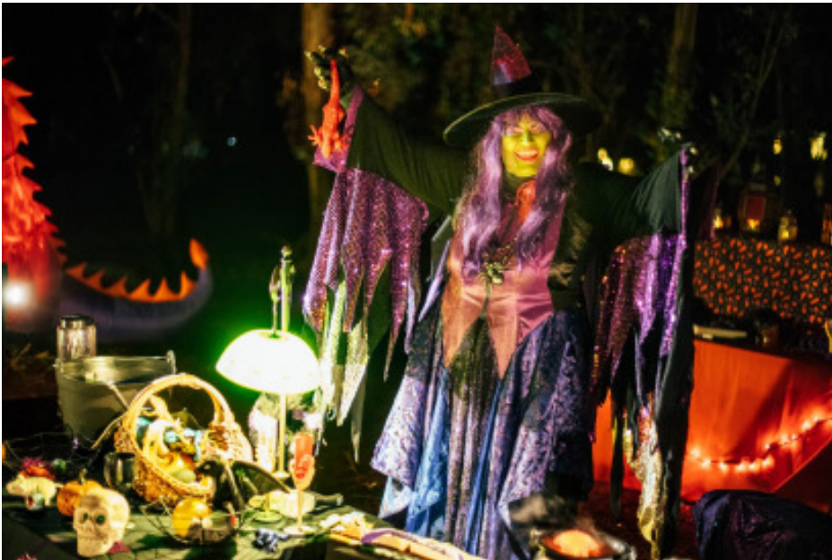
The famous Witch of Ardenwood (Beth Cary).