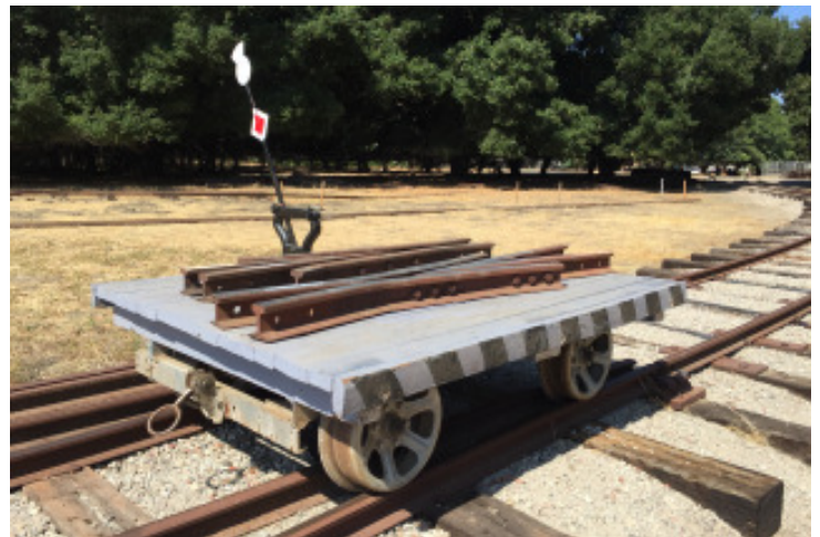
Push car with the #4 track frogs.