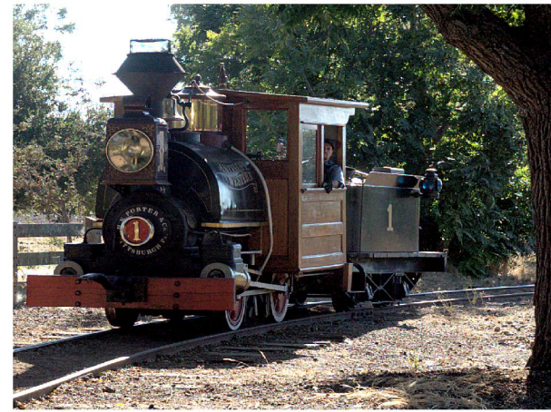
1889 Tank Porter Engine 'Antelope & Western #1'