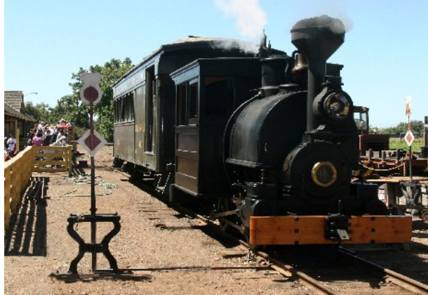
1890 Tank Porter Engine 'Cortez Mining Co #1