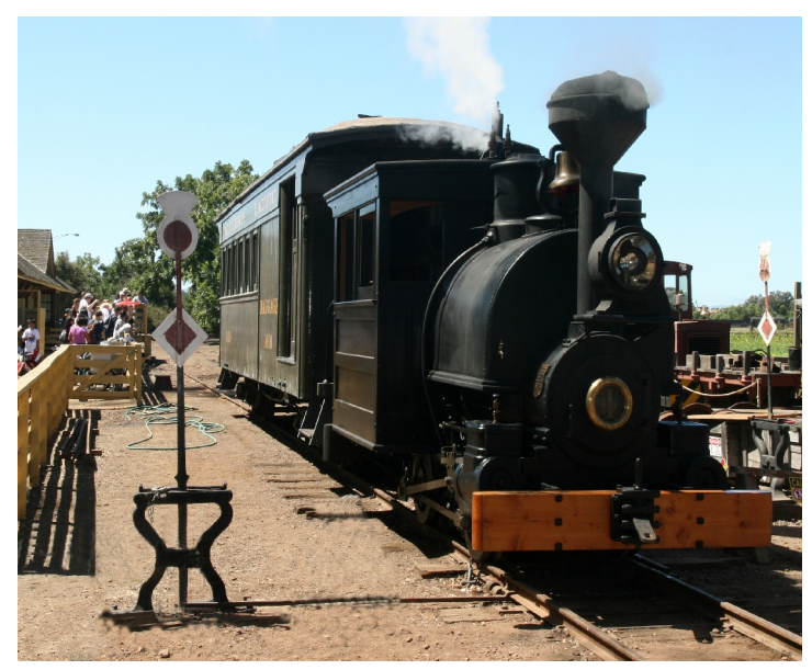
1890 Tank Porter Engine 'Cortez Mining Co #1' 'Ann Marie'