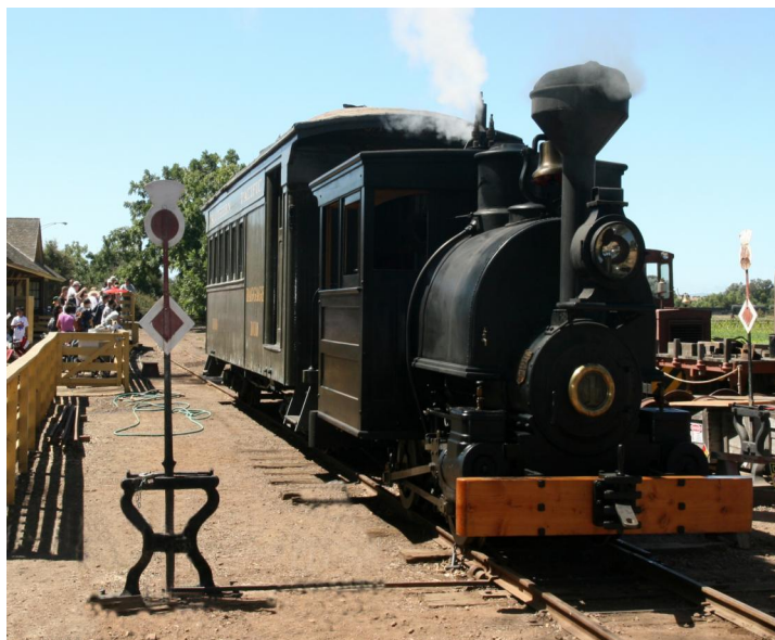
1890 Tank Porter Engine 'Cortez Mining Co #1' 'Ann Marie'