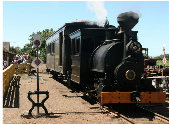
1890 Tank Porter Engine 'Cortez Mining Co #1'