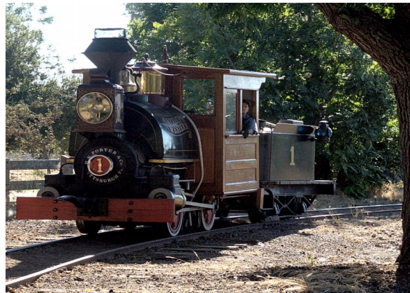
1889 Tank Porter Engine 'Antelope & Western #1'