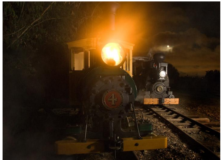
Moonlight at Deer Park Siding