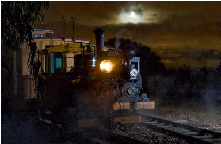
Eucalyptus, Steam, and the Moon