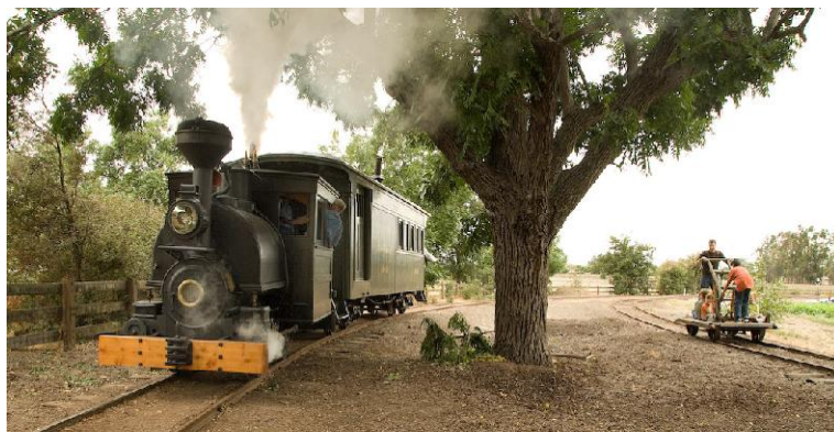
Ann-Marie on Jack's Curve with pump car -Bruce MacGregor