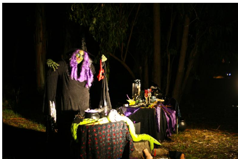
Beth Cary as the Witch of the Wood