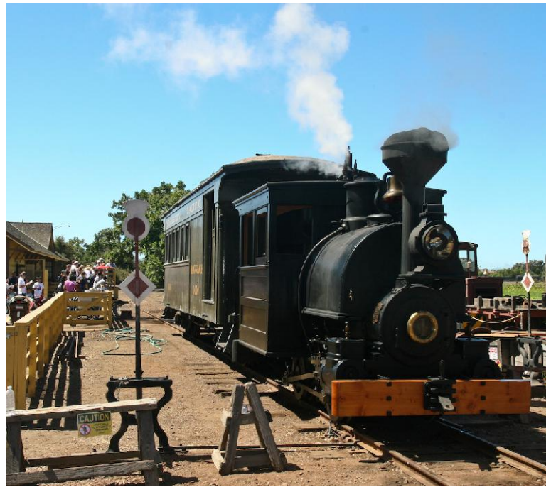
1890 Porter "Ann-Marie" Pulling SP 1010