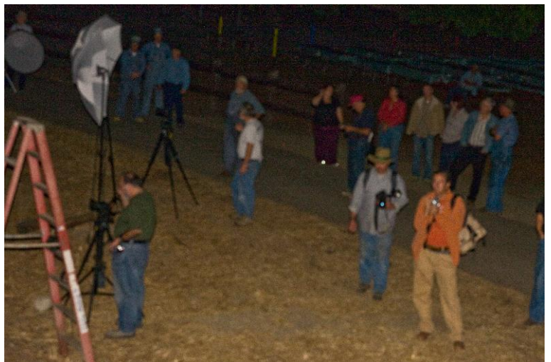
Nighttime photo shoot