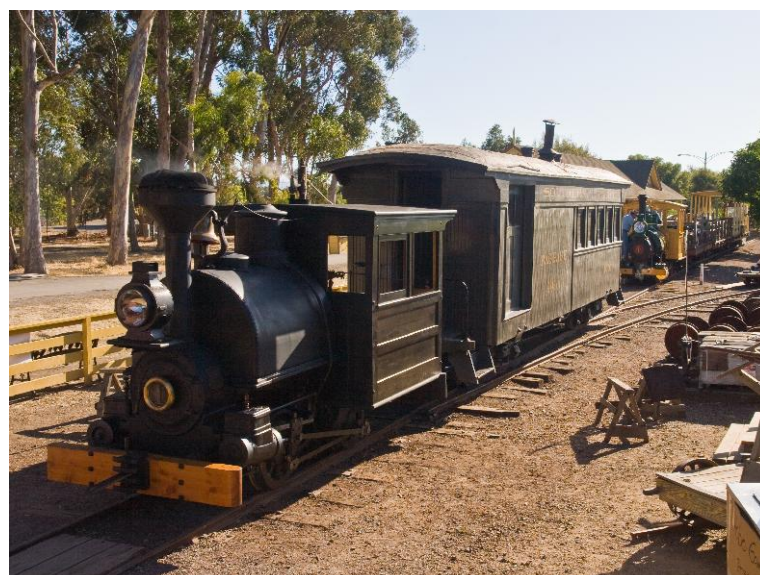
Two Trains at Ardenwood Yards