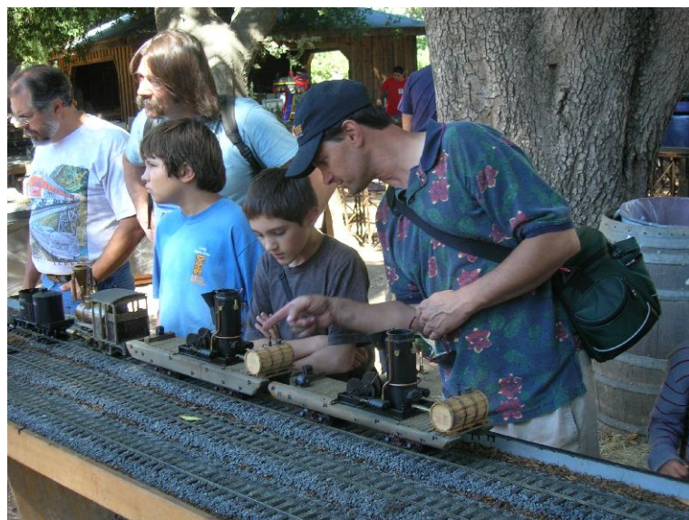
Visitor explaining live steamers to son