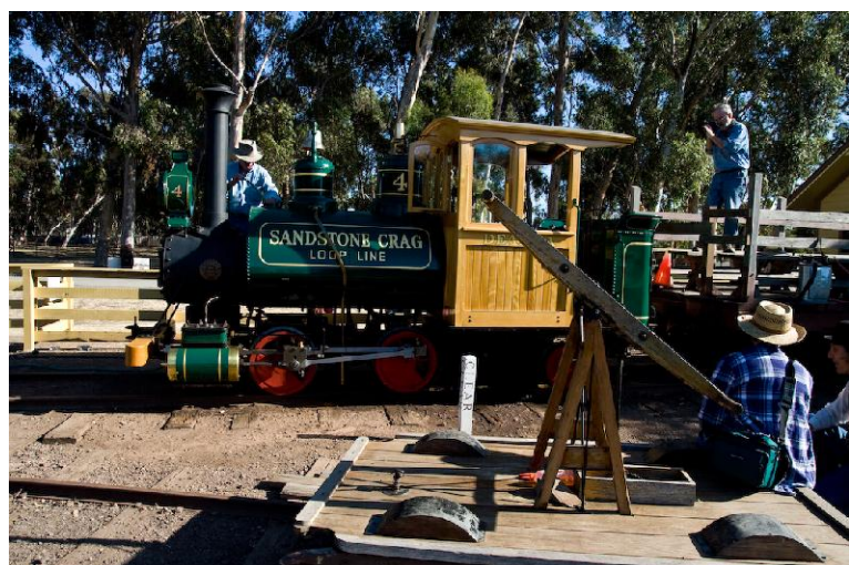
1891 Baldwin "Deanna" and handcar