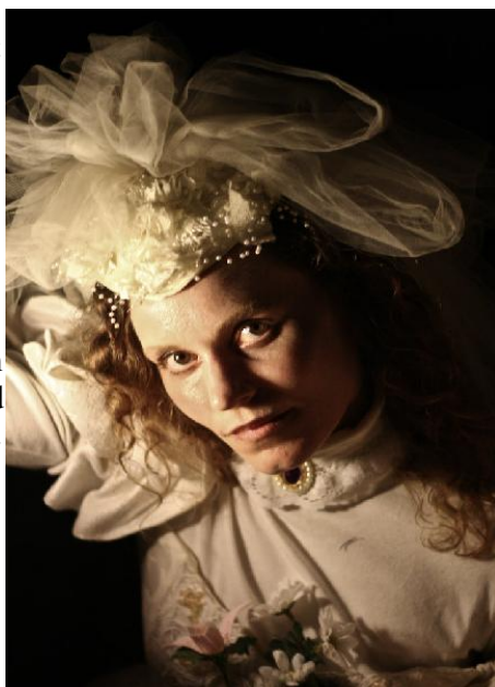
The Widowed Bride is Still looking